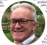
Better opportunities for Suffolk residents will come from the strategy, the Board believes.